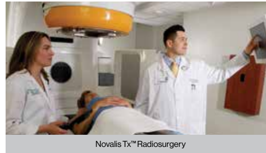
Novalis Tx™ Radiosurgery