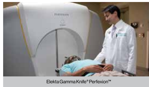
Elekta Gamma Knife® Perfexion™