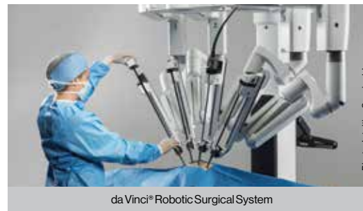
da Vinci® Robotic Surgical System