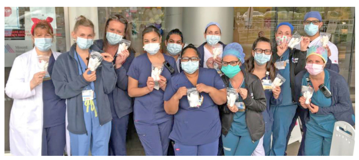
Mount Sinai South Nassau's Nurses' Celebrate Nurses' Day May 2020.