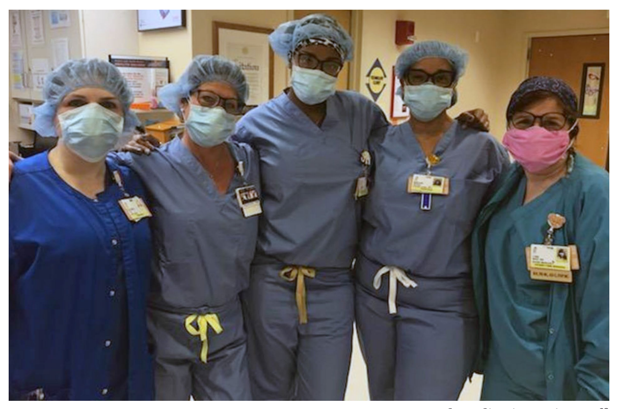
The Pediatric nursing Staff.