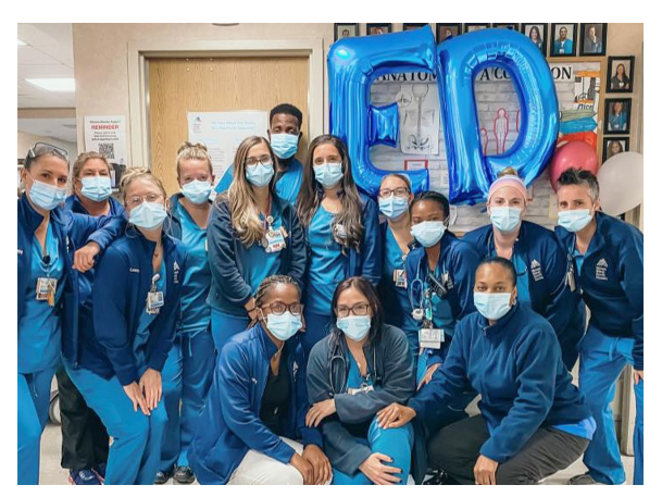
The ED Night Shift in 2020.

The Emergency Departments (ED's) are staffed with a complement of skilled clinical staff which provides a high level of clinical expertise. Both ED's were impacted by COVID-19 in 2020. The Oceanside ED saw an annual volume decrease of 15.5% from 2019 to 2020. In 2020, a total of 51,215 patients were seen at the Oceanside ED. While admissions dropped by 7.9% as well, the amount of time admitted ED patients boarded in the ED increased by 380%. This increase posed a significant hardship on the ED, requiring creative solutions to accommodate incoming ED patients while still caring for the admitted boarding