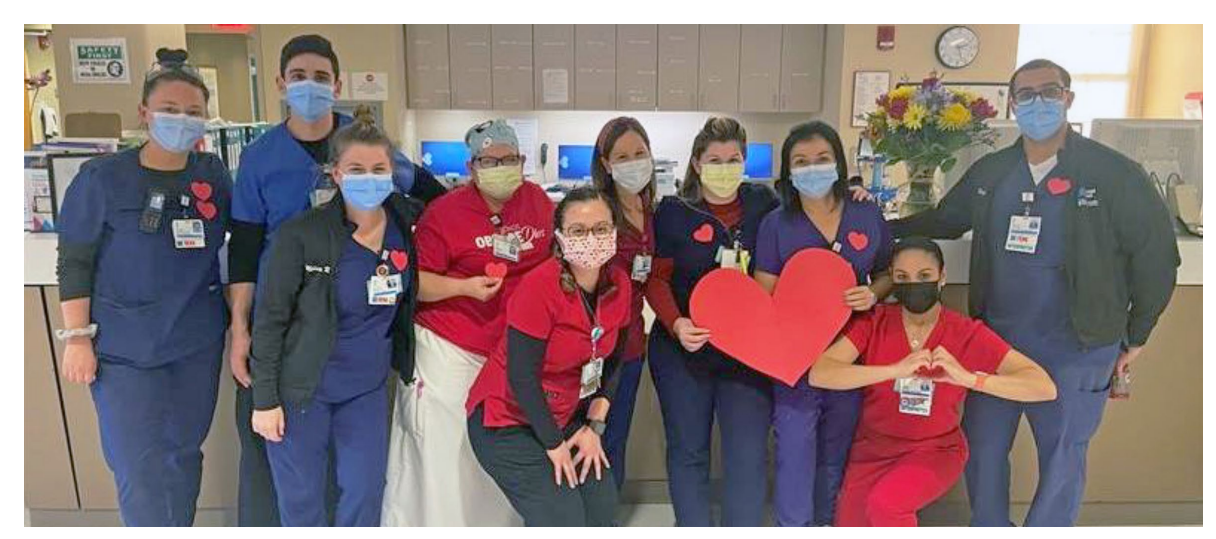
E2 Nursing Staff goes red.