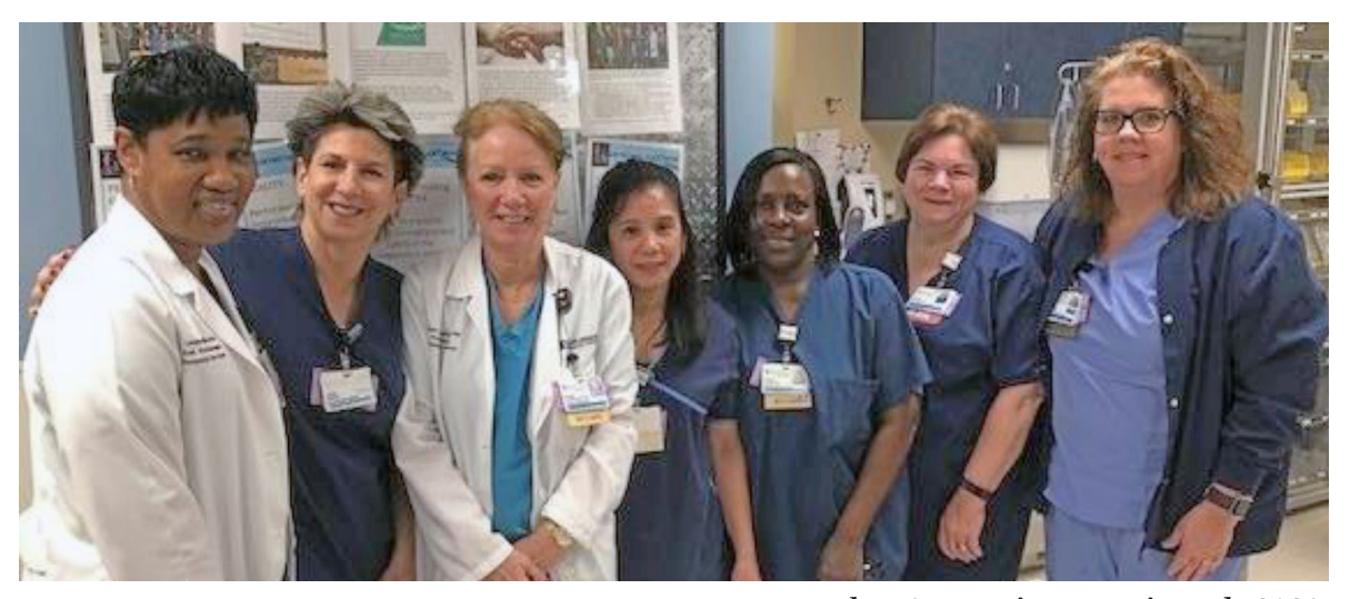
{\it The ASU Nursing Team in early 2020.}