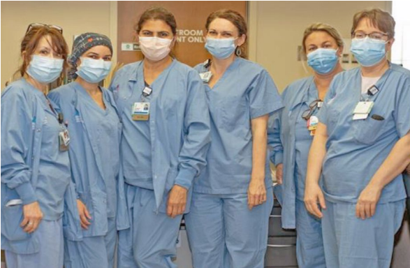
Our Cardiovascular Services Nurses 2020.