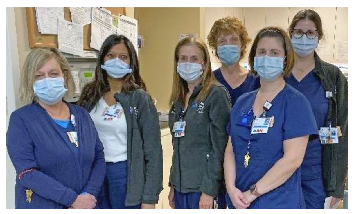
The D4 Nursing Team.