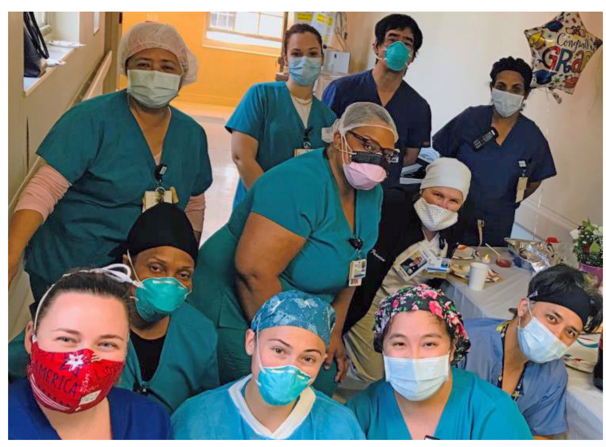
The Dialysis Team Celebrating Graduation.