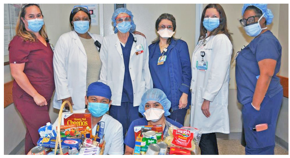
The IV Team supporting patients and staff in 2020.

of MSSN as well as continued education to staff, patients and families.