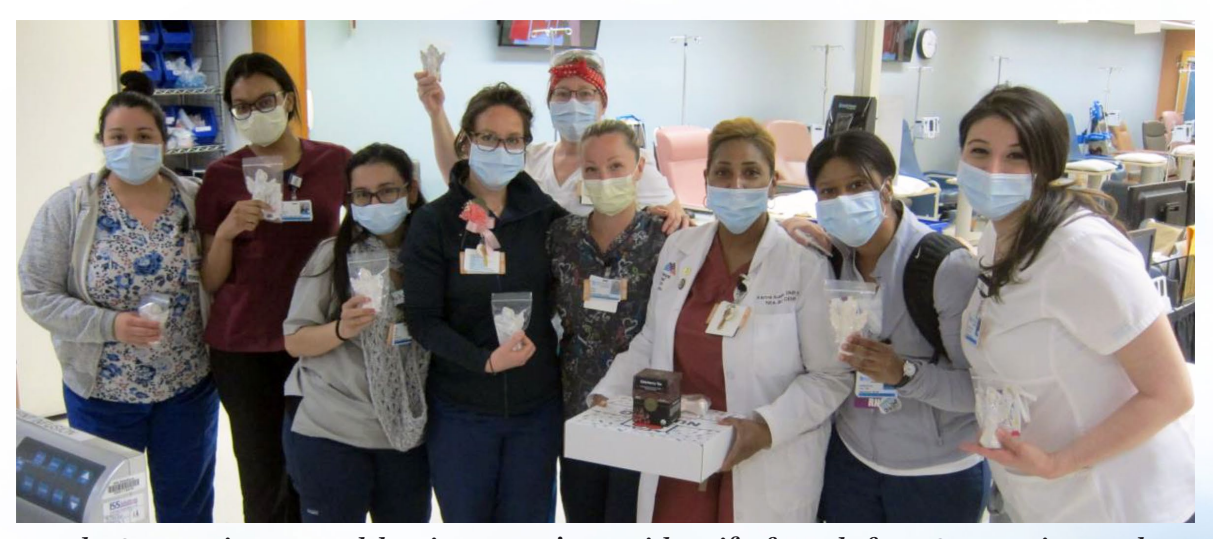
{\it The~OPI~nursing~team~celebrating~Nurses'} \ {\it Day~with~a~gift~of~Angels~from~Community~Members.}