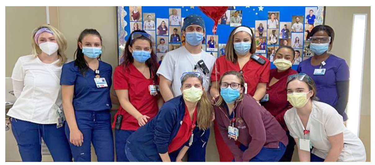
The D2W Team in 2020.