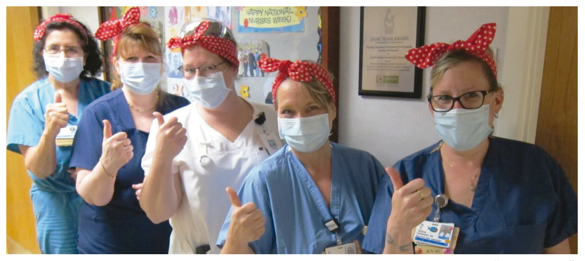
2020 Nursing Education Team reminds us "We can do it"!

At Mount Sinai South Nassau, our nurses are confident, professionals integrally involved in shared decision-making and structures. We support our nurses in seeking ongoing opportunities for education, professional development and clinical advancement. Superior job performance is acknowledged and rewarded.