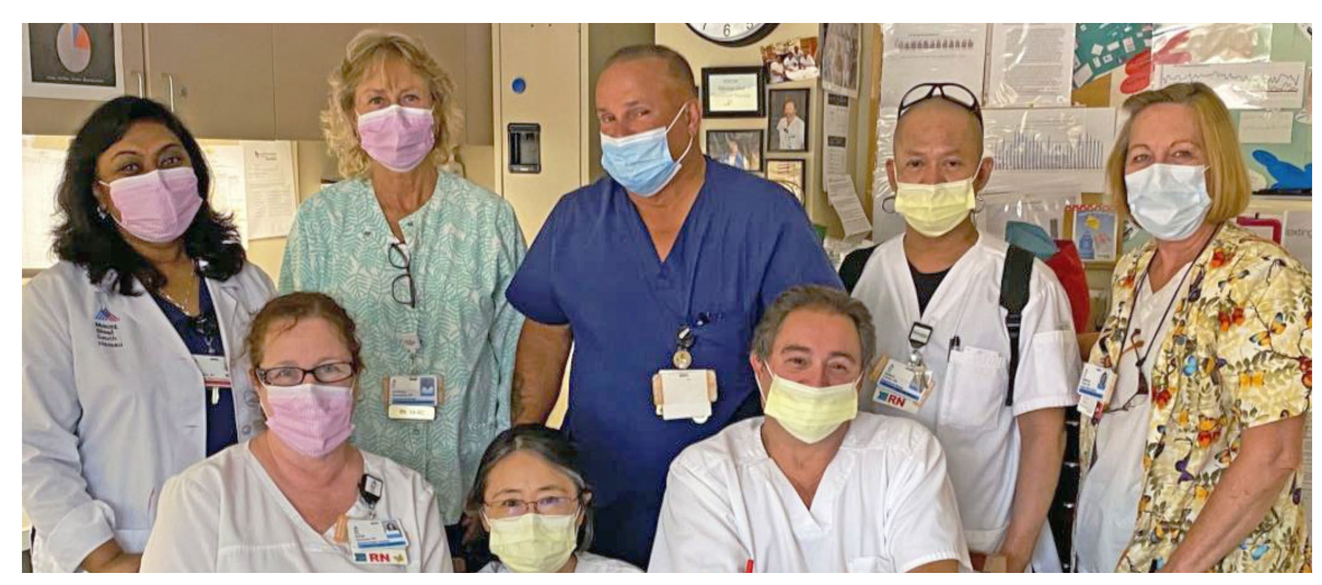
The IV Team supporting patients and staff in 2020.