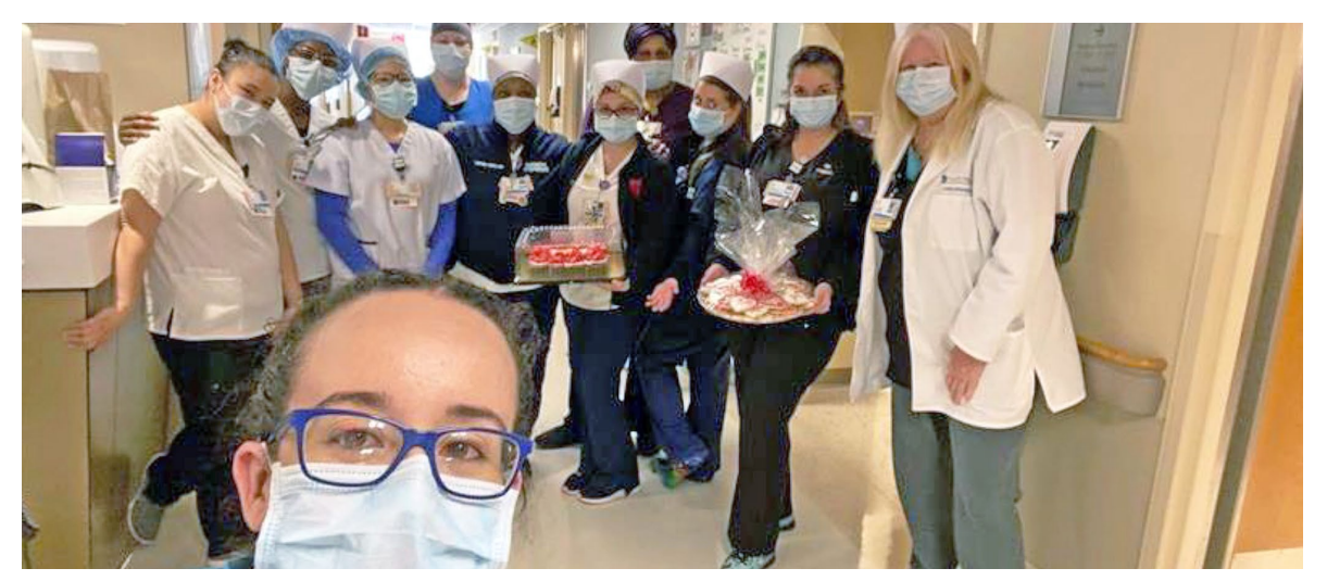
F1 Nursing Staff accepting a food donation from the community.