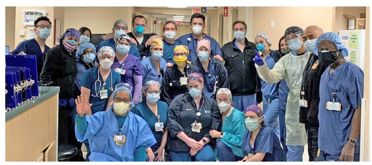
Our ED Nursing Team on the frontline in 2020!