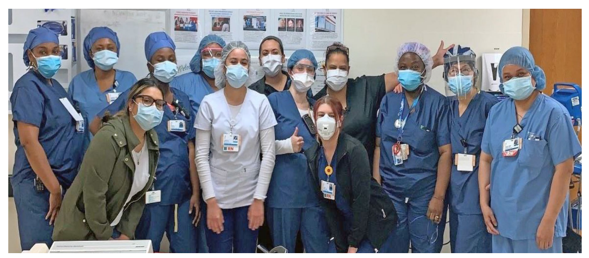
Interdisciplinary\ teamwork\ on\ G2/RCU\ ensures\ the\ best\ outcomes\ for\ Respiratory\ Patients.