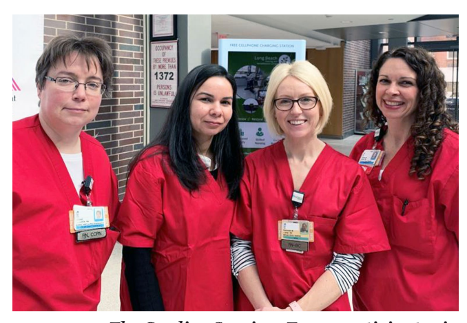
The Cardiac Services Team participates in February 2020 Go Red Event.

Mount Sinai South Nassau's Nurses are integrally involved in community service and truly served as first responders during the COVID-19 pandemic ,Although community screening events, public education, and community fundraising activities were limited in 2020, nurses participated in flu PODS, COVID-vaccine PODS, assisted many families in their local communities, and continued varied fundraising activities.