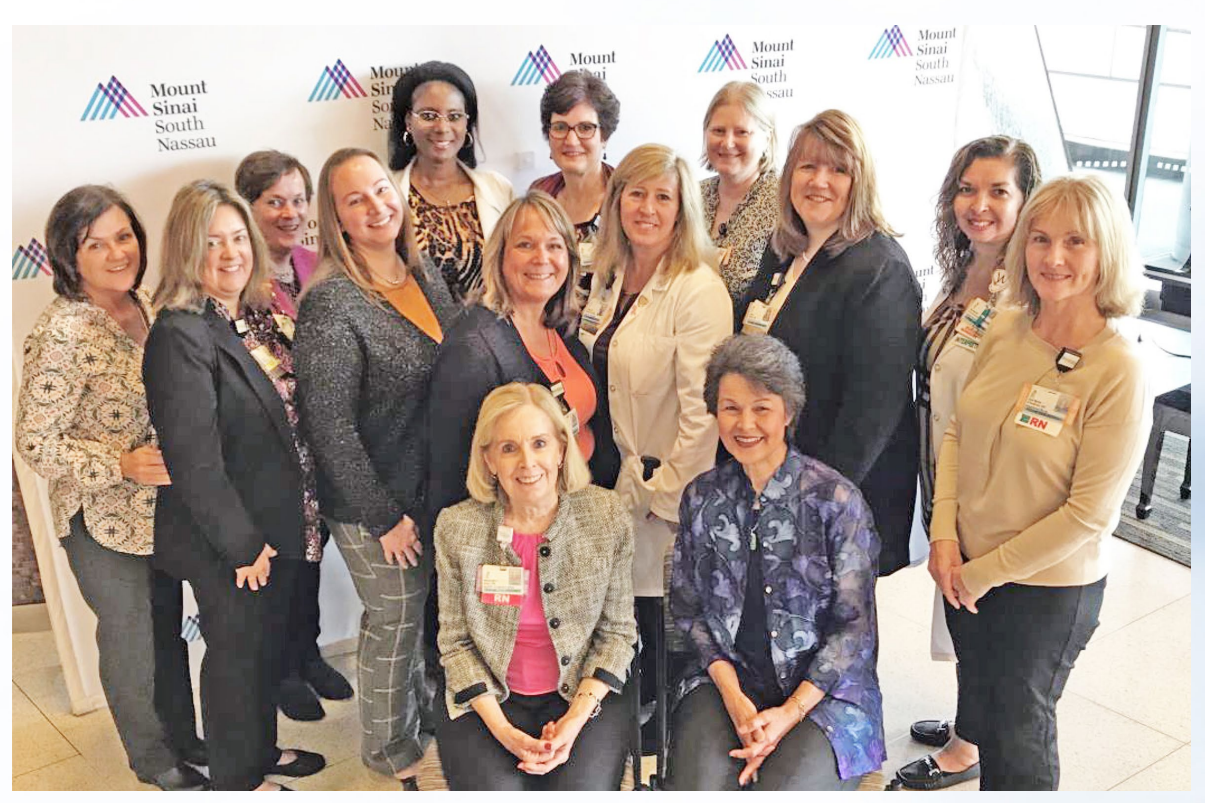
Members of the 2020 Nursing Research & Evidence-based Practice Council.