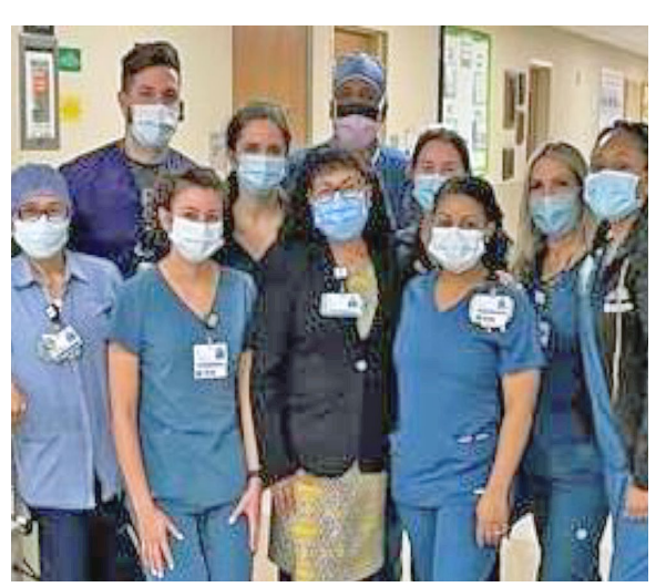
The Cardiac Services Team participates in February 2020 Go Red Event.