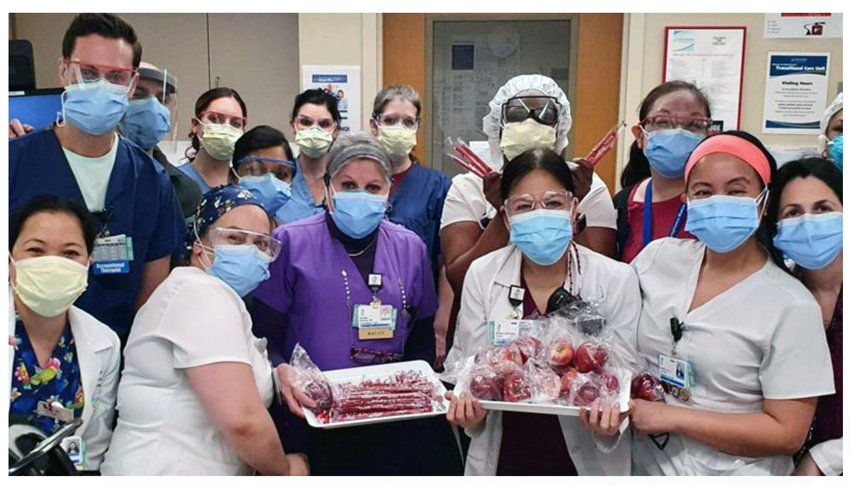
The TCU nursing team recognized during a Tip of the Cap activity.