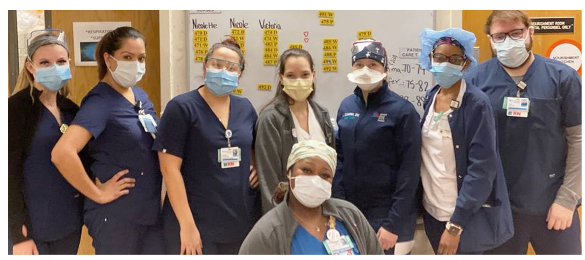
Staffing Office & Nursing Float Team.