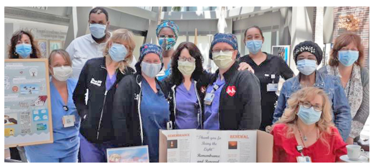
Members of the 2020 Holistic Council celebrate Nightingale's 100th Birthday.

individualized to the specific patient. The holistic council fosters collegiality and interdisciplinary collaborating in achieving the goals of care for the patients we serve. Their role in promoting self-care and stress management was essential in 2020.