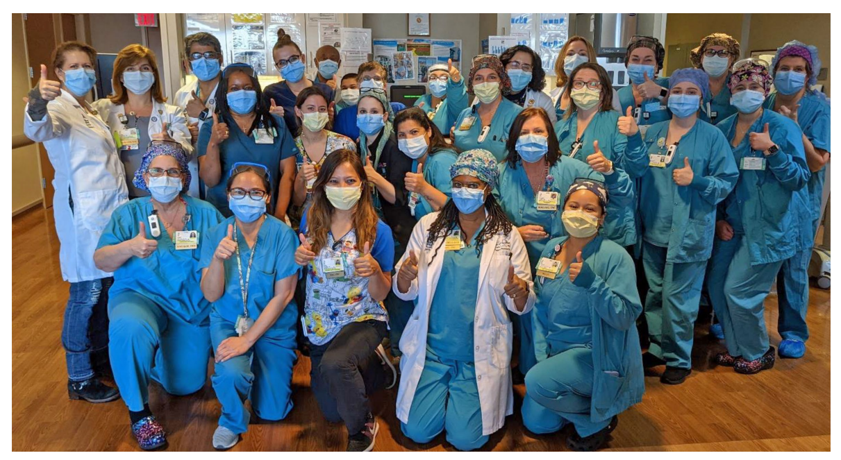
The Women & Children's Staff in 2020.

patient population on Pediatric, Level II Neonatal Intensive Care (NICU), Labor and Delivery (L&D) and Mother Baby units.